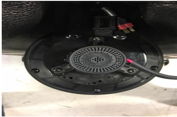
(2) Using a 3mm Allen key remove the three hex screws from the side of the motor cover