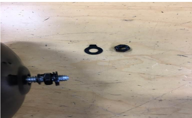
(4) Remove the hardware from the axle.