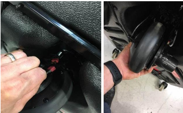
(3) Pull the wire coming from the motor to disconnect and remove it from the housing and pull the wheel off from the fork.