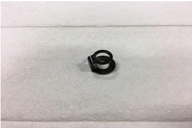
(5) This double washer clip needs to be discarded, NOTE: some replacement wheels might already have the new hardware and the clip may not be on them.