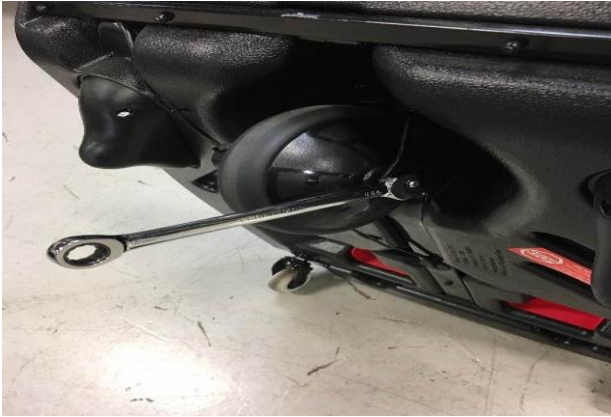
(1) Place the unit on its side and using a 13mm spanner loosen up the lock nut from the axle of the front wheel.